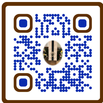
Lay Reader Training

Join Zoom Saturday Breakfast Bible Study Meeting / Meeting ID: 959 5450 6553 /Passcode: 027913