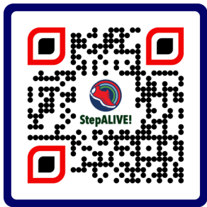
Immanuel Youth Walk-a-Thon

You are invited to join our walk-a-thon at StepALIVE! to help fight poverty and hunger! Come to our 9:00 a.m. Sunday Eucharist at Zabriskie Chapel on the 15 th and join us afterward for a walk to support local charity ALIVE! plus our neighbors most in need!