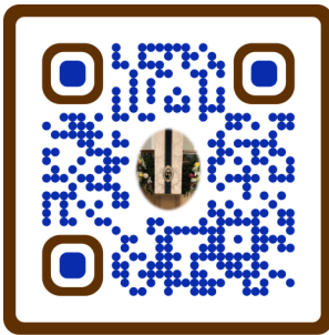
Lay Reader Training

Due to today's Forum Hour, we've postponed hosting our brief Lector Training session until next Sunday, 21 st — we host trainings each Sunday following the 10:30 a.m. Eucharist in Immanuel Chapel. The purpose is to enhance sound quality of the service and to make sure readers are comfortable, announce, and are prepared to serve. Those who have read before but want pointers on how to project their specific voice in a slightly echo-y spacious chapel, should feel free to join us.