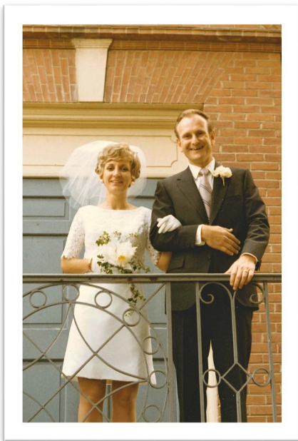
Rollin and Ann Huntington Zabriskie Chapel

Send in all of your favorite photos of Baptisms, Weddings, Confirmations and Homecoming Services taken at Seminary Chapel, Seminary Memorial Garden Chapel, and Zabriskie Chapel. We'll take a look back at how Seminary Chapel is still with us and how that sacred space is still used today; along with a nostalgic look at special sacraments, and events that took place at Zabriskie. Deadline for entries is May 15, 2022.