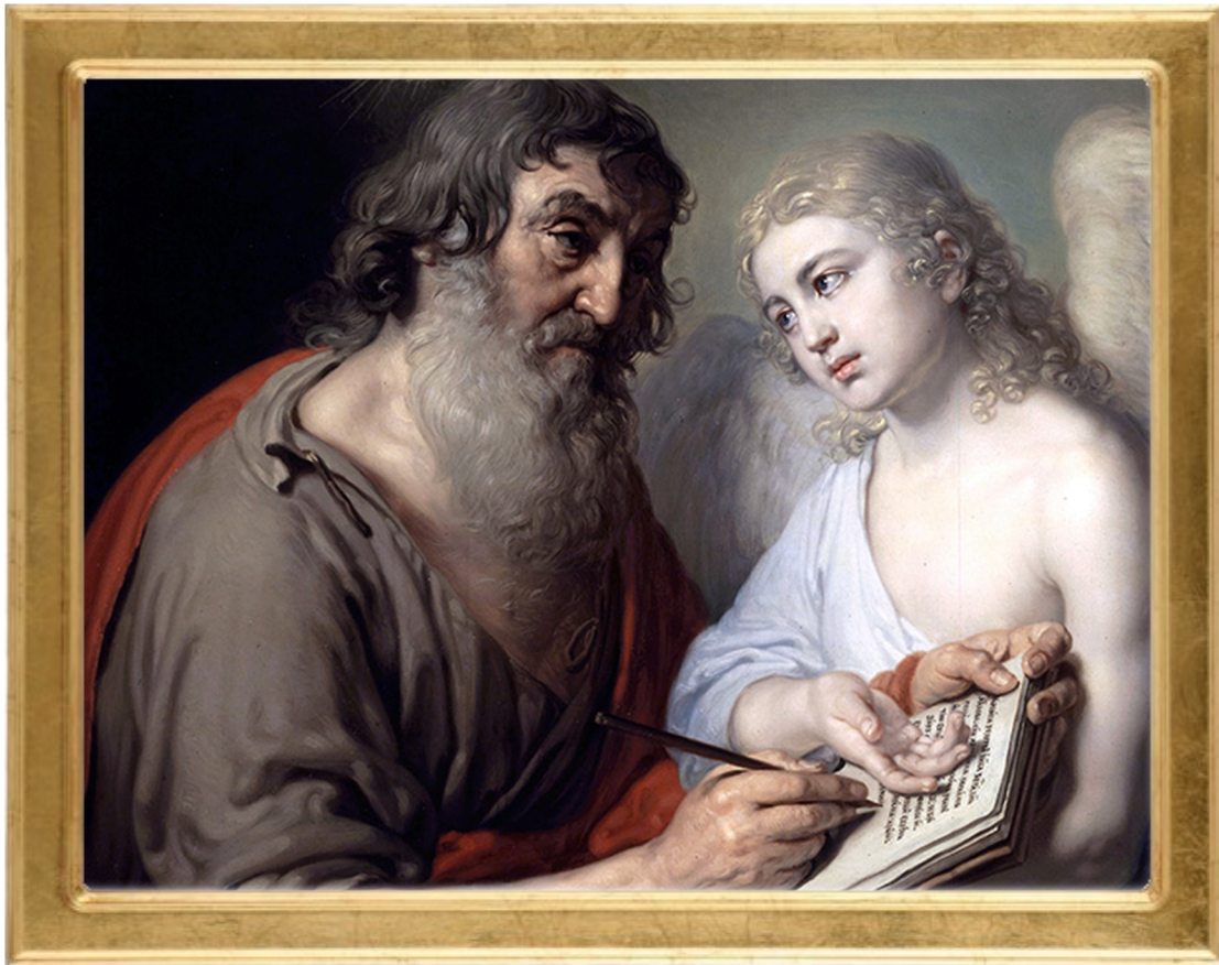
Vladimir Borovikovsky, 'St. Matthew the Evangelist', ca. 1804-1809 / Public Domain)